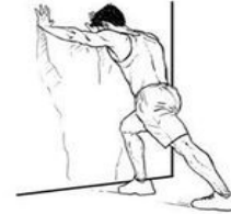
Calves - 2